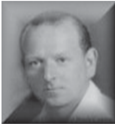
Dr. EDWARD BACH, M.B.B.S., M.R.C.S. of London

All these thirty-seven flowers, found together in their natural habitat in one place only, called Mount Vernon , a small village in the thick English forest. Who discovered them?